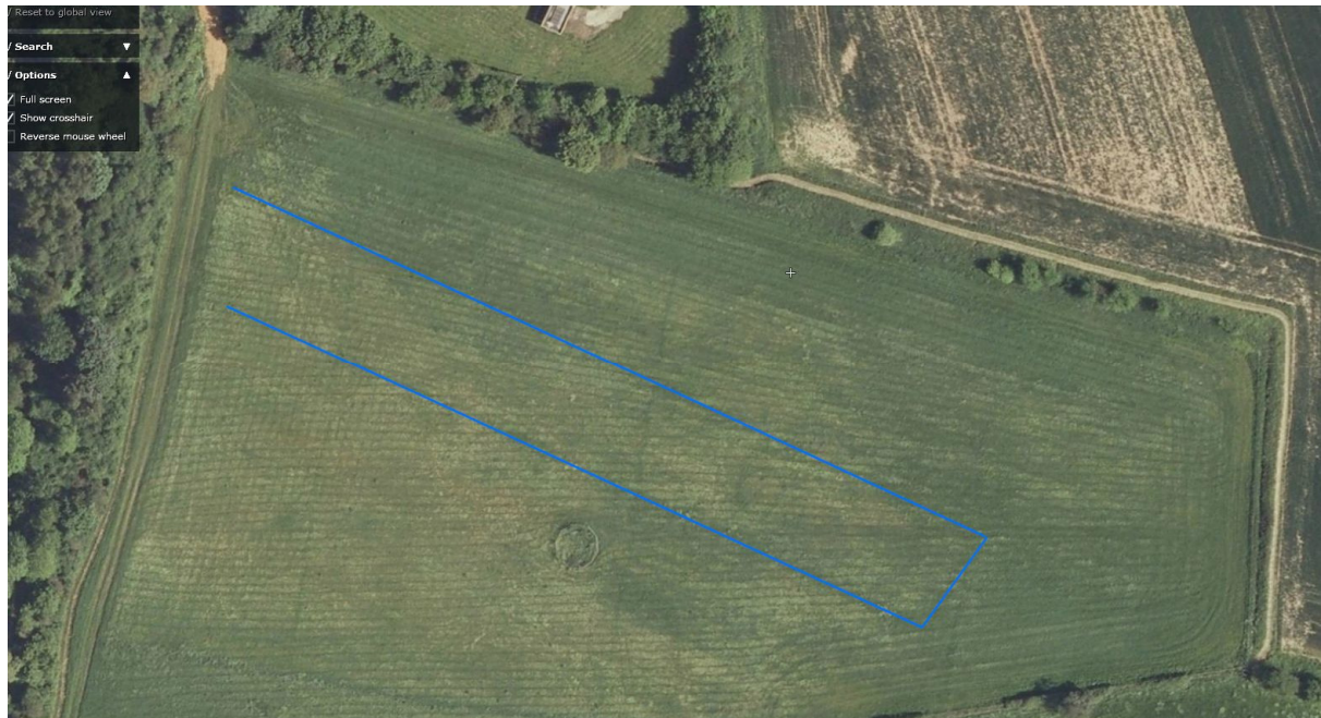
Image taken from Flash Earth of Bures Cursus with cursus picked out in blue (Marriott, 2013)

According to Suffolk Archaeology Unit there have been no recorded excavations of any of these features to date.