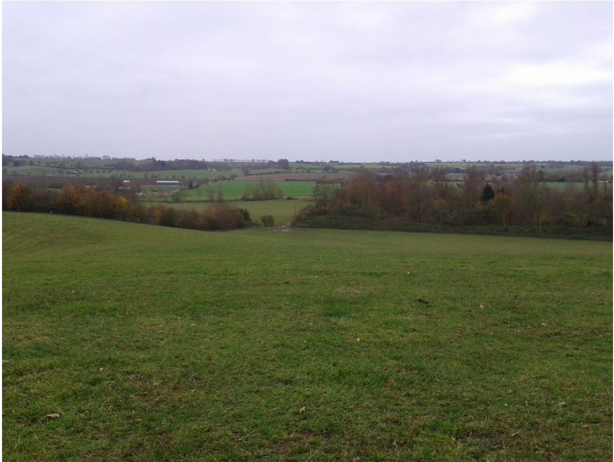
View from Clicket Hill towards 9194 site of cursus (green field in centre of photo, beyond the first hedge line) – Photo E Mead 3.12.13