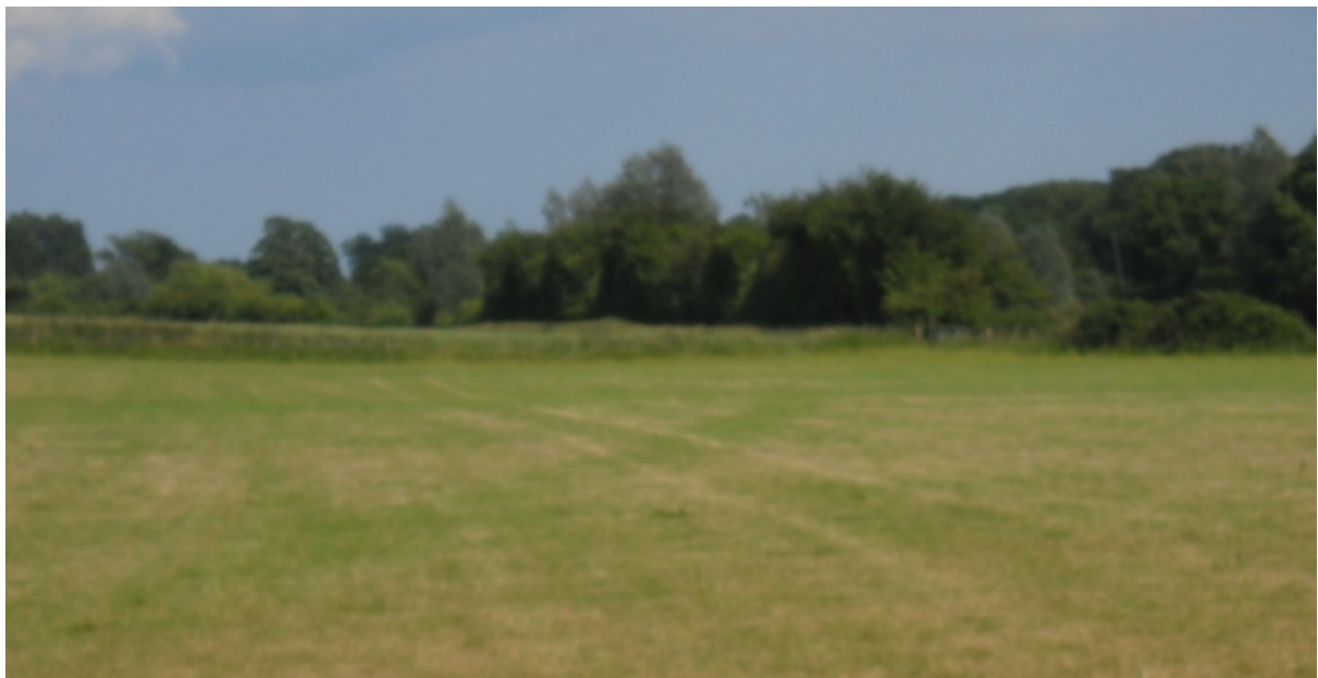
Bures Alignment looking ESE