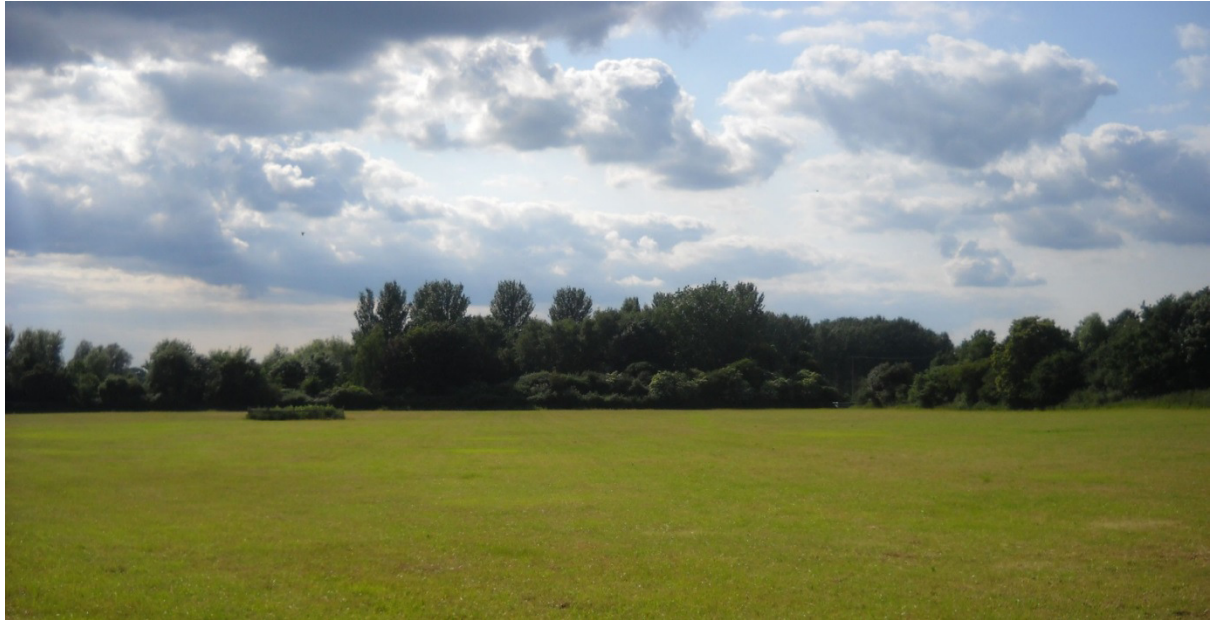
Bures Alignment looking WNW