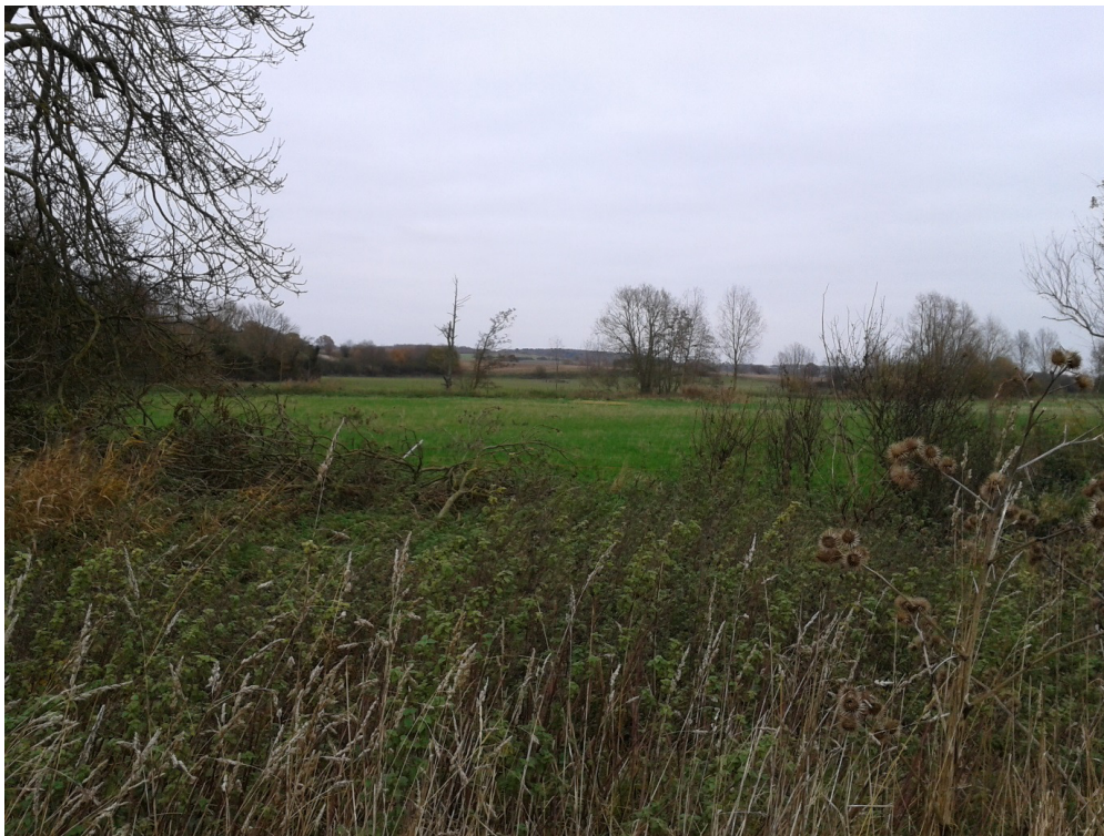
View from just East of the Cowlins site looking across Stour towards site of Bures cursus ( in field just beyond the trees in centre of photo)