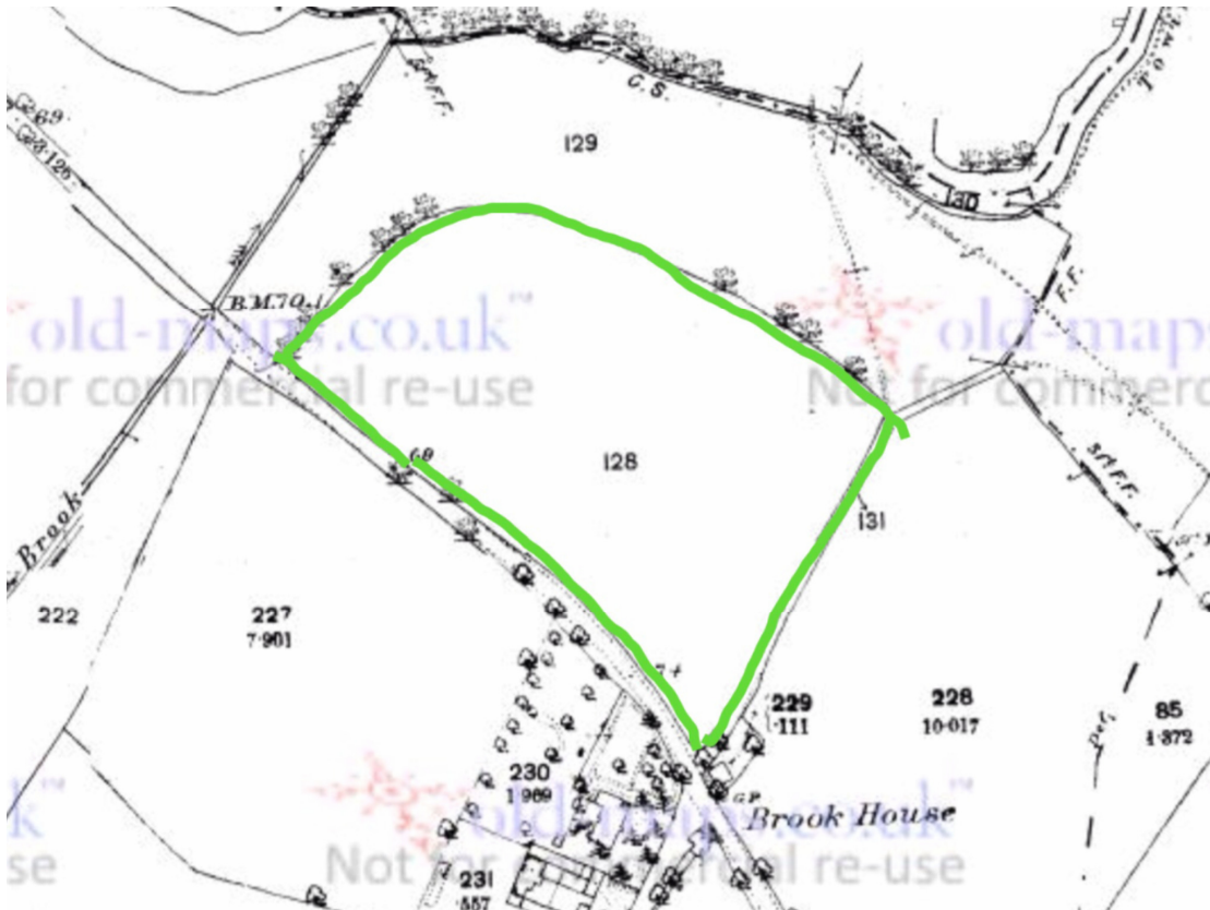
Figure 1: Ordnance Survey County Series Essex 1876

The river that forms the northern boundary has been realigned and engineered to power Bures Mill, which is situated on the other side of the river immediately to the north. The Cambridge Brook runs down the western boundary before joining the Stour to the north west. The B1058 forms the southern boundary.